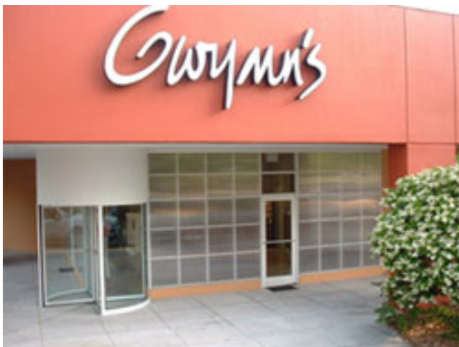
16mm RDC Storm Panels for commercial businesses protect windows from strong winds and flying debris during hurricane season.