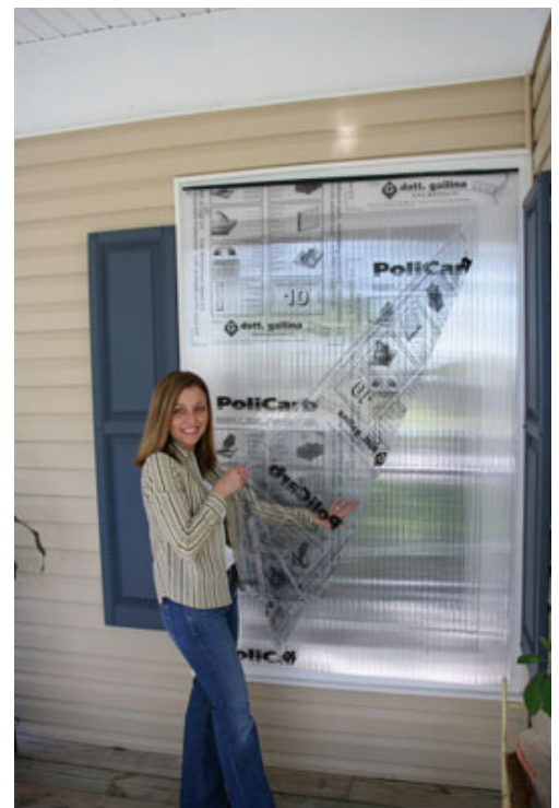
16mm RDC Storm Panels for homes protect windows from winds and flying debris during hurricane season.

For installation instructions, warranty, and Miami-Dade County official record, visit our website: www.gallinausa.com/photo.galleries/stormpanels.html